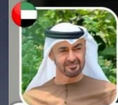
His Highness Sheikh Mohamed Bin Zayed Al Nahyan UAE President