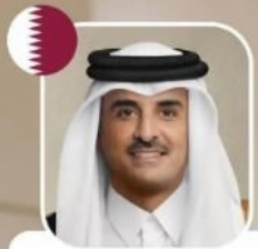
His Highness Sheikh Tamim Bin Hamad Al Thani Qatar Emir