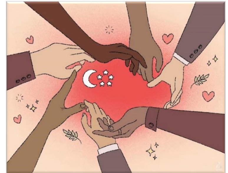
Illustration: CNA/Nurjannah Suhaimi